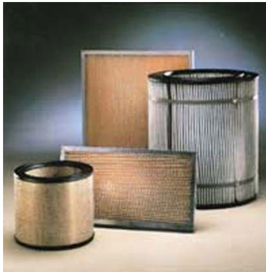
Photo Caption - Cartridge filters offer large surface area for filtration within a limited space.

Telephone: (800) 367-3591 Fax (813) 991-9700 E-mail: info@americanfabricfilter.com